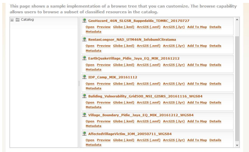
Figure 2. List of registered Geographic Information Services.

The ESRI Geoportal Server runs on the Apache Tomcat Web Server at port 8080 and was connected to the PostgreSQL DBMS. This combination was simpler than the geoportal set up by Mabeya and Waithaka [11]. The geoportal was used to register services from WMS Services as show in Figure 2.